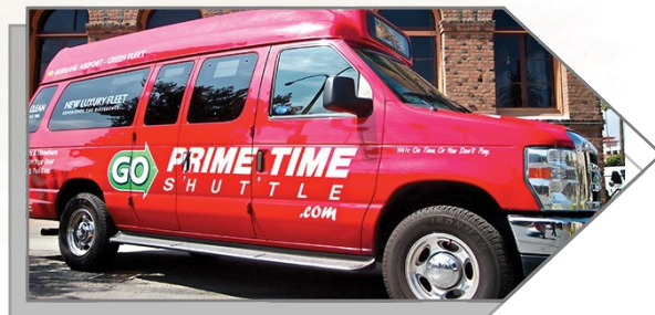
Prime Time Shuttle

The Prime Time Shuttle is a shared van service and can be reserved via online at: www.primetimeshuttle.com